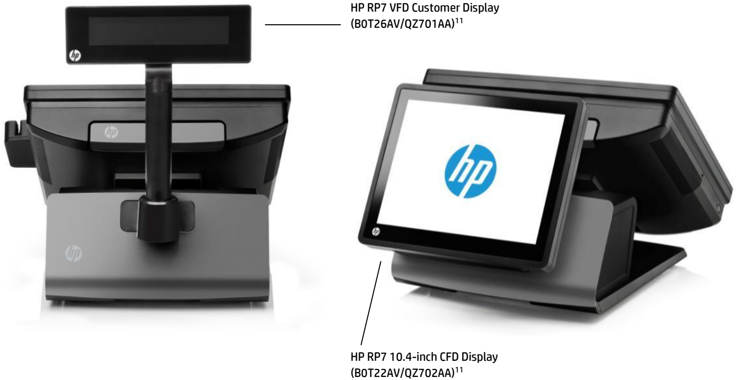
HP RP7 VFD Customer Display (BOT26AV/QZ701AA) 11