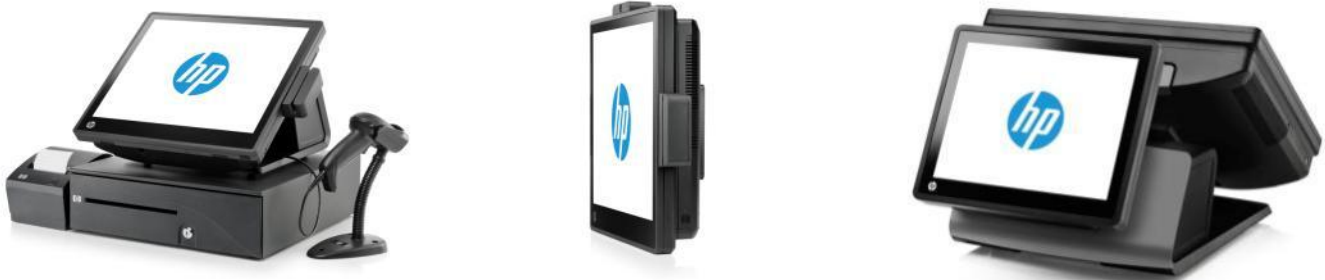
Left to right: The HP RP7 Retail System with cash drawer, printer, and barcode scanner. The HP RP7 Retail System wall mounted with a magnetic stripe reader and webcam. The HP RP7 Retail System configured with a customer-facing 10.4-inch diagonal display. Note: All images depict the Projected Capacitive display.

For more information, please visit www.hp.com/go/pos .